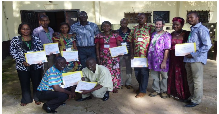
Participants with their certificates of completion

My favorite part of the trip was the fellowship I had and the friendships made with all the participants. Each day, we spent about 12 hours together in classes and meals. All of our meals were eaten around one big family table. The discussions and fun we had during those meals was very special. From my very first meal with the group, I felt part of the family. For me, it was a small foretaste of what heaven will be like when we will all fellowship together and worship the Lord forever!