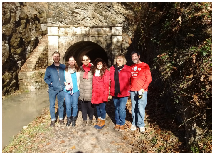
Hiking at the Paw Paw Tunnel