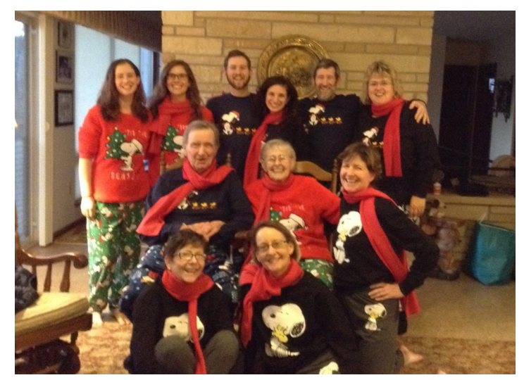
Buchanan clan in Snoopy pajamas!