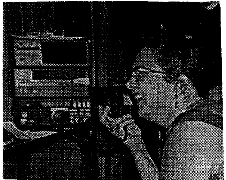
Radio- the next best thing to being there.