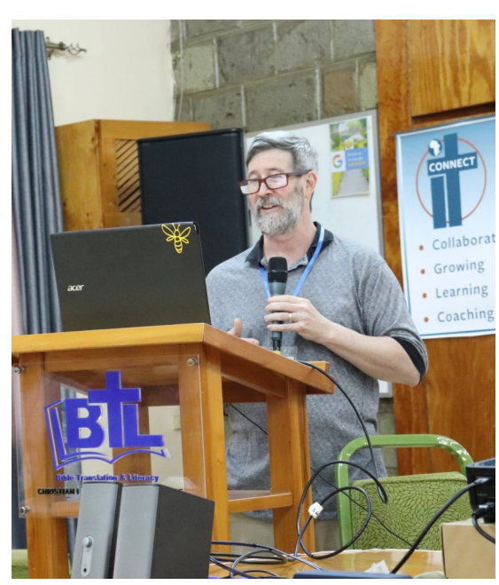
Leading a session on setting priorities and goals

Each morning our table group had a devotional/prayer time together