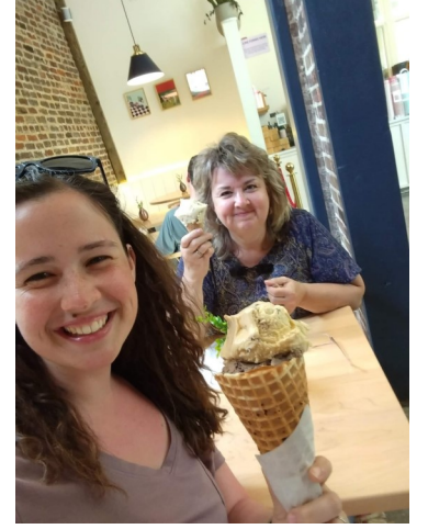
Elizabeth's favorite snack food we enjoyed almost everyday!