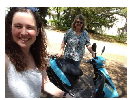
I relived my moped days from when I was 14 and rented these two mopeds on Folly Beach!! So much fun!