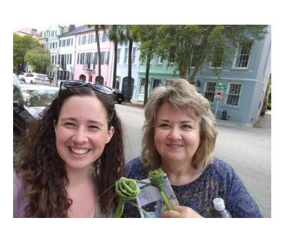
We found Rainbow row! Each house is painted a different color.