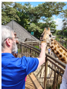
Feeding a giraffe

On the day I arrived, before the training started, a friend and I visited a giraffe sanctuary. I was instructed to place the food on their tongue and be aware that if I got too close without food, they may head-butt me! The entire group also took one morning off to visit a tea plantation and learn all about how to harvest tea. We learned which part of the tea plant gets picked (the tender leaves) and we were split up into teams to see which team could harvest the most tea in 15 minutes. My team won in both quality and quantity of leaves picked, but our triumph was tempered by the fact that an experienced harvester could fill a basket on their own in about the time it took us to barely cover the bottom!