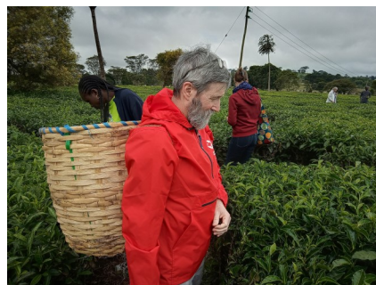
Tea picking competition